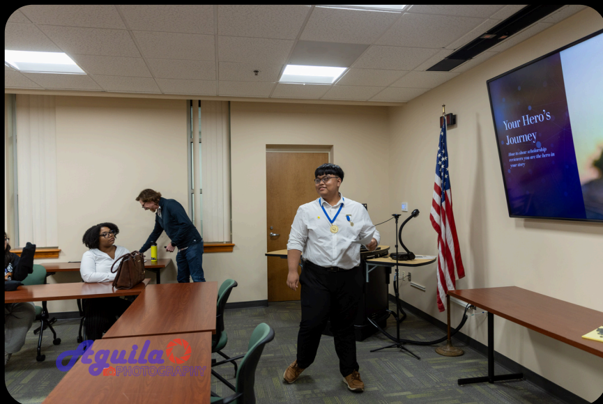
Your Hero's Journey Info Session (Middle States Region Fall Leadership Conference)

VP of Fellowship – PTK Beta Alpha Tau Maryland/DC State President – Middle States Region PTK (2025-2026) President , Student Government VP of Media & Publicity , Student Honors Council Board Member , Student Alumni Council Vice-Leader , Calvary Mission Church Youth Worship Leader , Calvary Mission Church