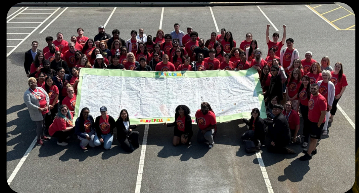
Middle States Region Summer Institute 2025

Fellowship, to me, is about helping people feel that they belong before they feel expected to lead. As Vice President of Fellowship and later as Maryland/Washington, D.C. President for Phi Theta Kappa, I focused on creating spaces where students could connect, share their stories, and see themselves as part of something larger than their chapter. At the regional level, this meant engaging students across campuses and backgrounds, while at my home college it meant working through Student Government to bridge communities and support students who felt uncertain or unseen. Through these roles, I learned that fellowship is built through listening, inclusion, and consistency—less about position.