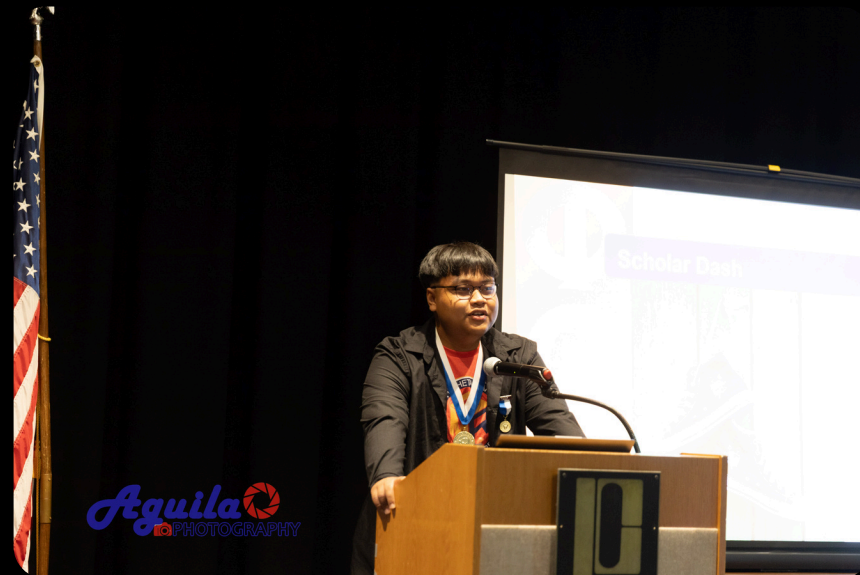
Middle States Region Summer Institute 2025

Presidential Honors Scholarship (Spring 2025, Fall 2025) Faculty Honors Endowed Scholarship (Spring 2025, Fall 2025) Dr. Christine Gray Memorial Scholarship (Fall 2025) ·Phi Theta Kappa – Global Leaders of Promise Scholar (Fall 2025) Constellation Energy Scholarship (CCBC) (Fall 2024, Spring 2025, Fall 2025)