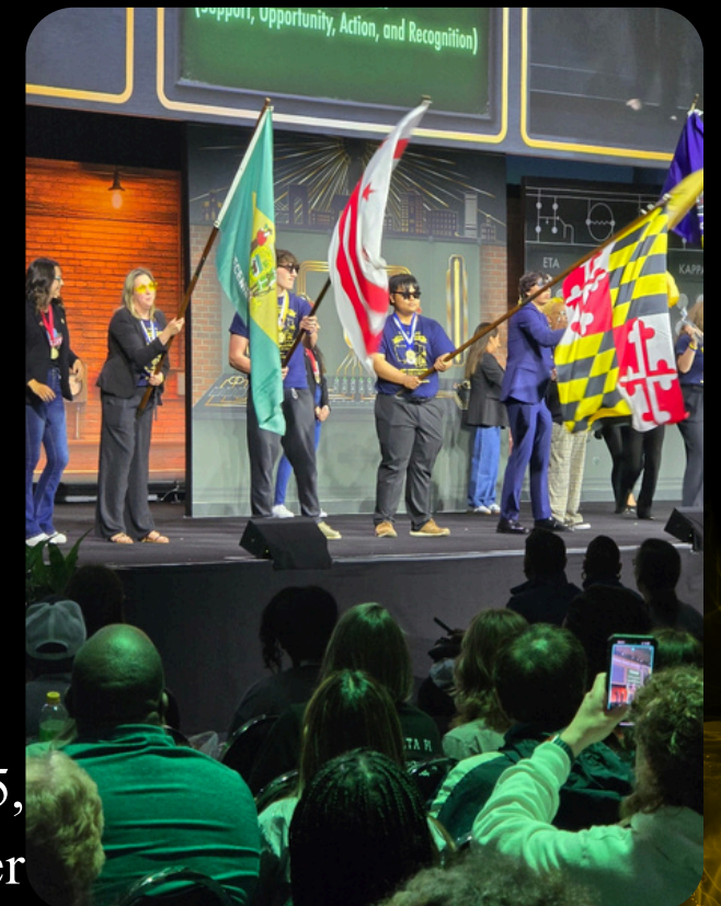
Catalyst 2025, Maryland Flag Bearer