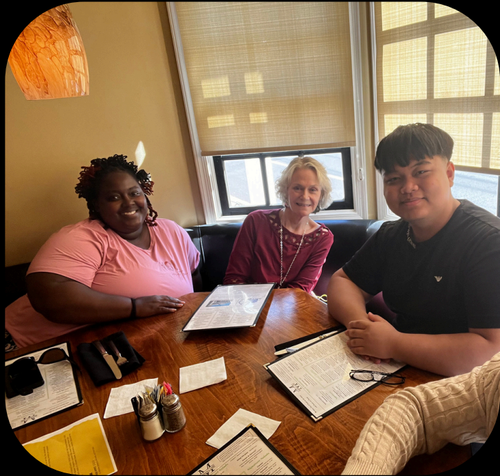
With Beta Alpha Tau Chapter! In the middle is our beloved chapter advisor and MSR associate regional coordinator...

My family has two unique siblings: my big sister and me.