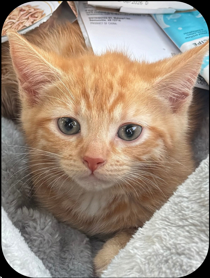
My Cutie Cat, Luna!