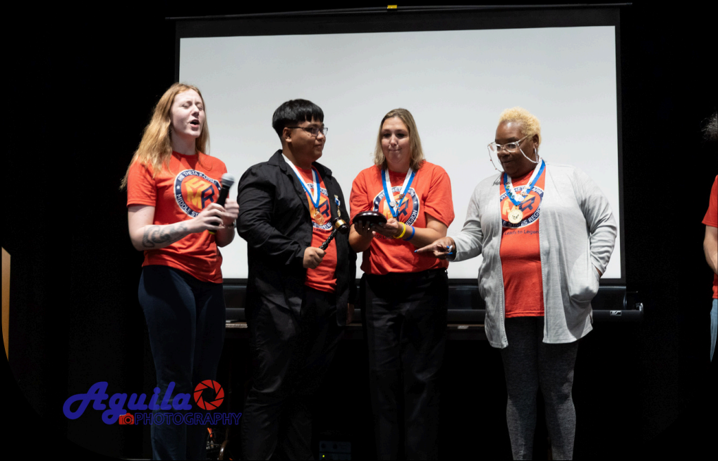
Middle States Regional Officers!

My family has two unique siblings: my big sister and me.